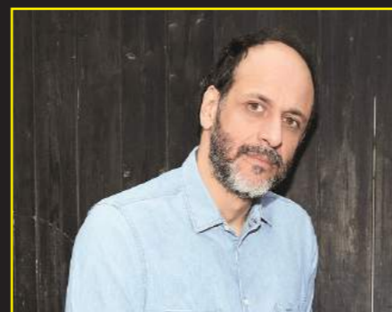
GENEVA AWARD LUCA GUADAGNINO (P. 10)

27 th Edition of GIFF Geneva International Film Festival 05 – 14.11.2021 GIFF.CH