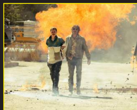
TSCHUGGER (P. 13)