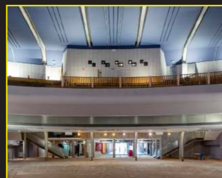
GENEVA DIGITAL MARKET AT LE PLAZA (P. 24)