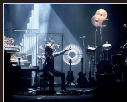
OPENING CEREMONY STEPHAN EICHER (P. 11)