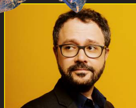
FILM & BEYOND AWARD RIAD SATTOUF (P. 10)