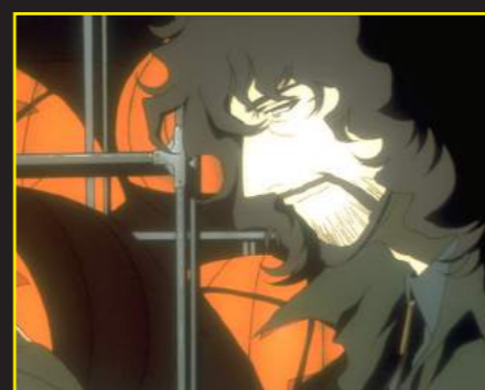
POP TV (P. 19)