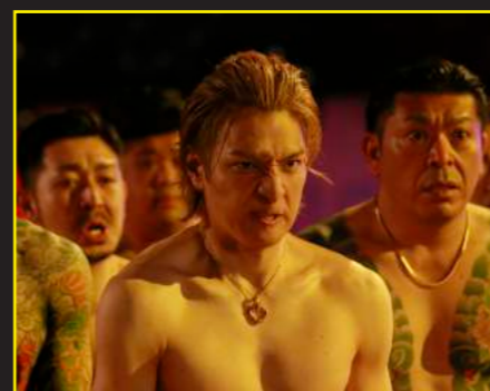
THE MOLE SONG: UNDERCOVER AGENT REIJI - FINAL (P. 13)