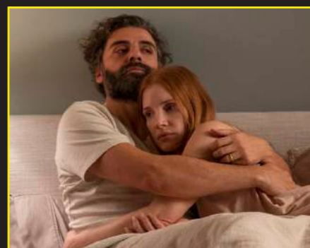
SCENES FROM A MARRIAGE (P. 13)