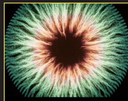
WHAT IS LEFT OF REALITY (P. 17)