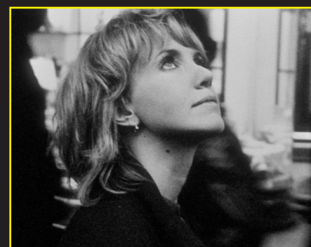
GENÈVE ÇA TOURNE - REDUX (P. 20)